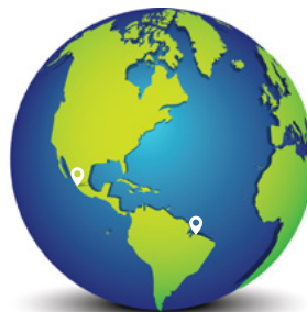
NORTH & SOUTH AMERICA