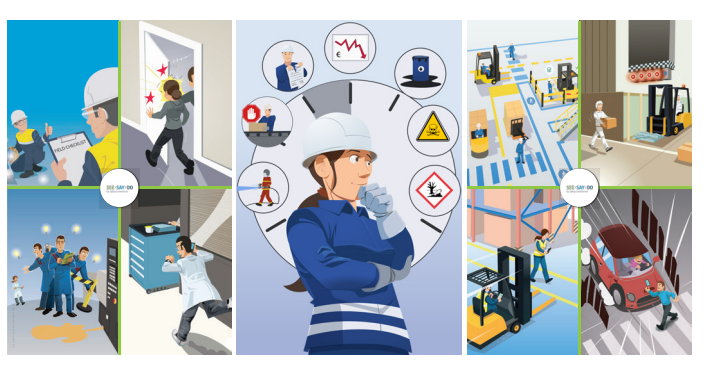
Global Facility Safety Program

We are uncompromising in our commitment to health and well-being.